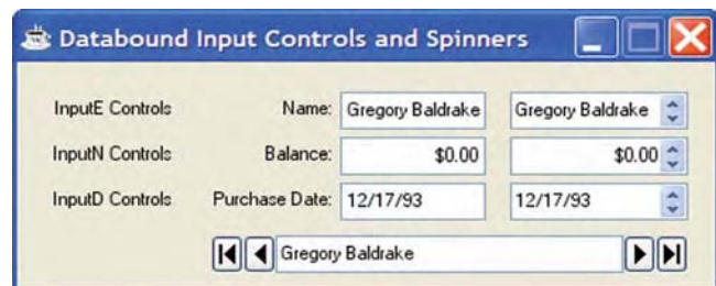
Figure 2. Example of InputN, InputD, and InputESpinners