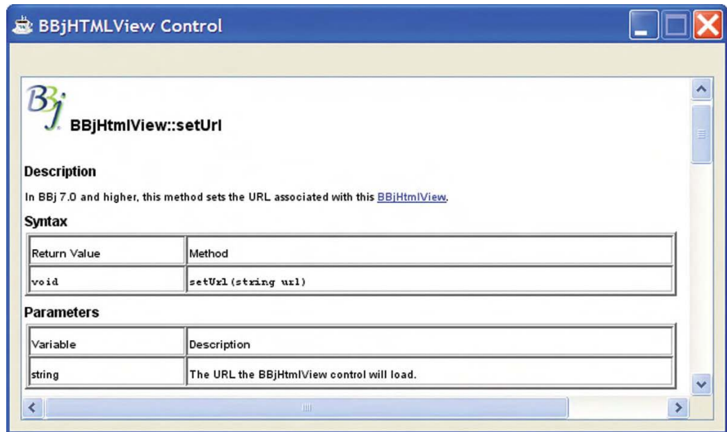
Figure 3. A BBJHtmlView displaying online documentation

Perhaps the most common implementation of this feature is to display online documentation as shown in Figure 3 . New callbacks – HYPERLINK_ACTIVATE, HYPERLINK_ENTER, and HYPERLINK_EXIT – provide the developer with a host of options to respond to user clicks and mouse moves within the control.