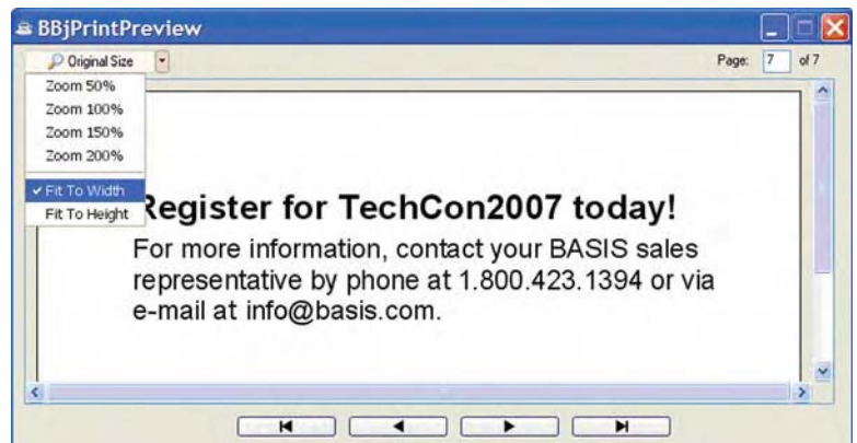
Figure 4. Zoom capability and custom navigation buttons in a print preview

To create a customized preview similar to the one shown in Figure 4 , use custom buttons, including the new MenuButton, and the many new methods now in BBj to navigate and display pages in any number of ways. Choose to display first and last pages or two pages at a time, utilize a page count, set the zoom factor, or localize the display, to name a few of the options available to the programmer with this new control.