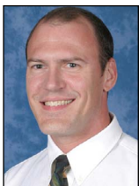
By Nick Decker Engineering Supervisor

CSS offers many benefits beyond that primary goal as CSS has continued to evolve, and add greater functionality, due in part to users and website designers demanding new features and capabilities so that web pages can compete with traditional desktop applications. Although CSS has conventionally been used to style web pages, BBX® developers can now reap the benefits of CSS when deploying their applications in BASIS' Browser User Interface (BUI).