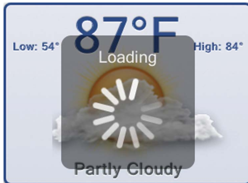
Figure 5. Custom Busy Indicator

Another example of a custom control is the loading indicator that displays when the "BUI Weather" portion of the same demo program refreshes its data. Figure 5 shows how this custom control notifies the user that the app is busy loading new weather data.