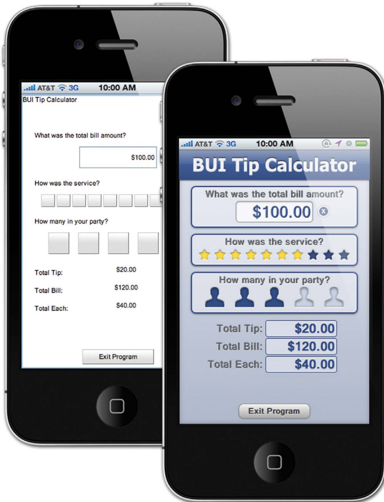
Figure 1. A BUI app running without custom CSS (left) and with custom CSS (right)